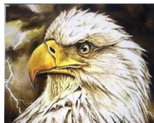
Great White Eagle

211 I laid my hands against the rock and looked up towards Heaven and started praying. I heard a Voice coming out of the top of the rocks there, said, "What are you leaning against, over your heart?" And I raised back like this, my bare shoulders; naked from my waist up, hot. I looked back. And there was wrote in the quartz, in the stone, " White Eagle "; just exactly what the vision said that THE NEXT MESSAGE WOULD COME FORTH BY. 212 I was so excited, I run home; got a camera and come back the next day, and took the picture of it. It was still there, wrote in the rock: "White Eagle." (Dove leading eagle.)